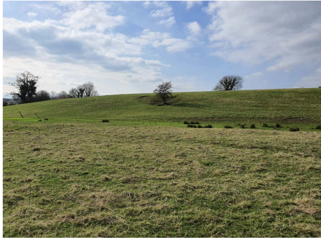
2. View across lands of elevation change and mature specimen trees.