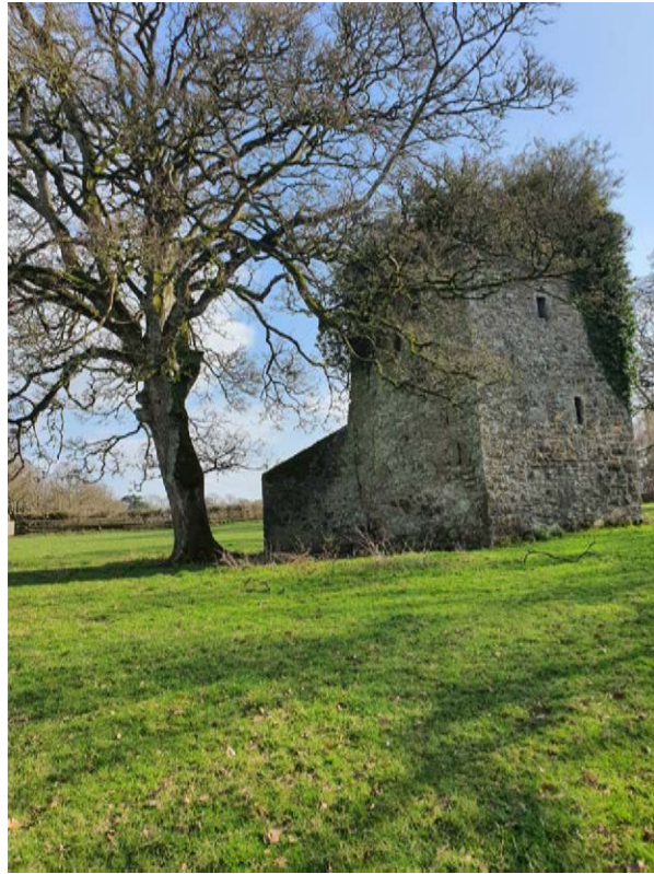
1. Moygaddy Castle - Tower house in ruins