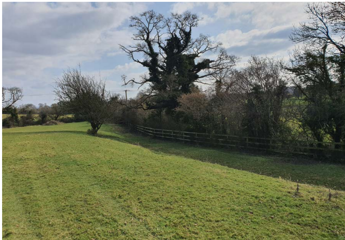
3. Typical agricultural boundary condition found throughout the lands