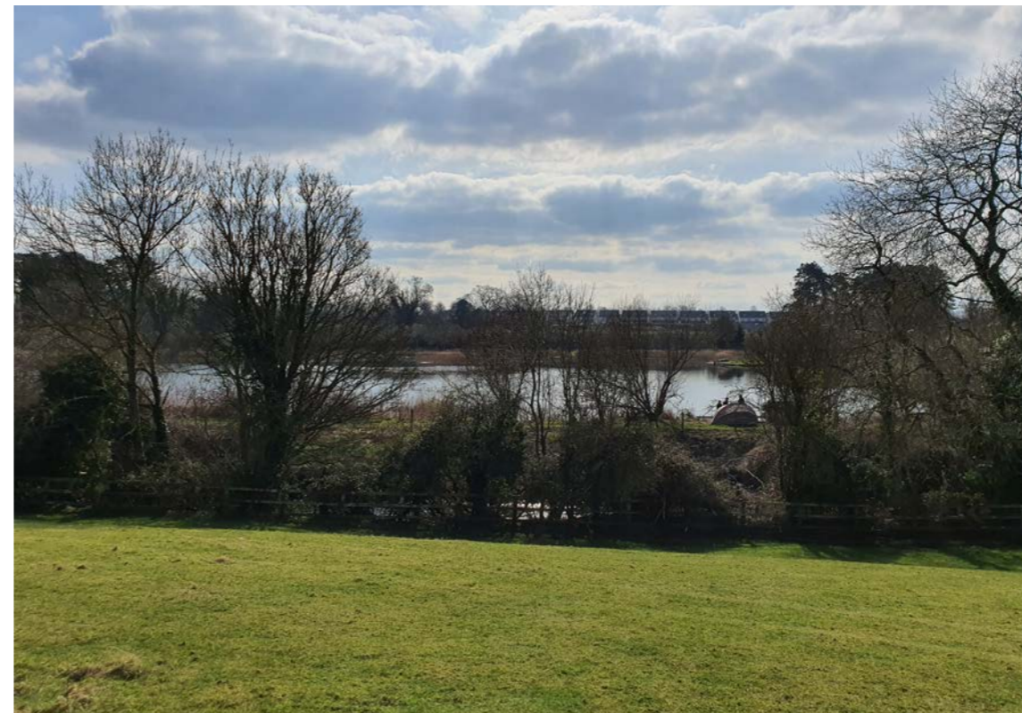
4. View across the Rye River