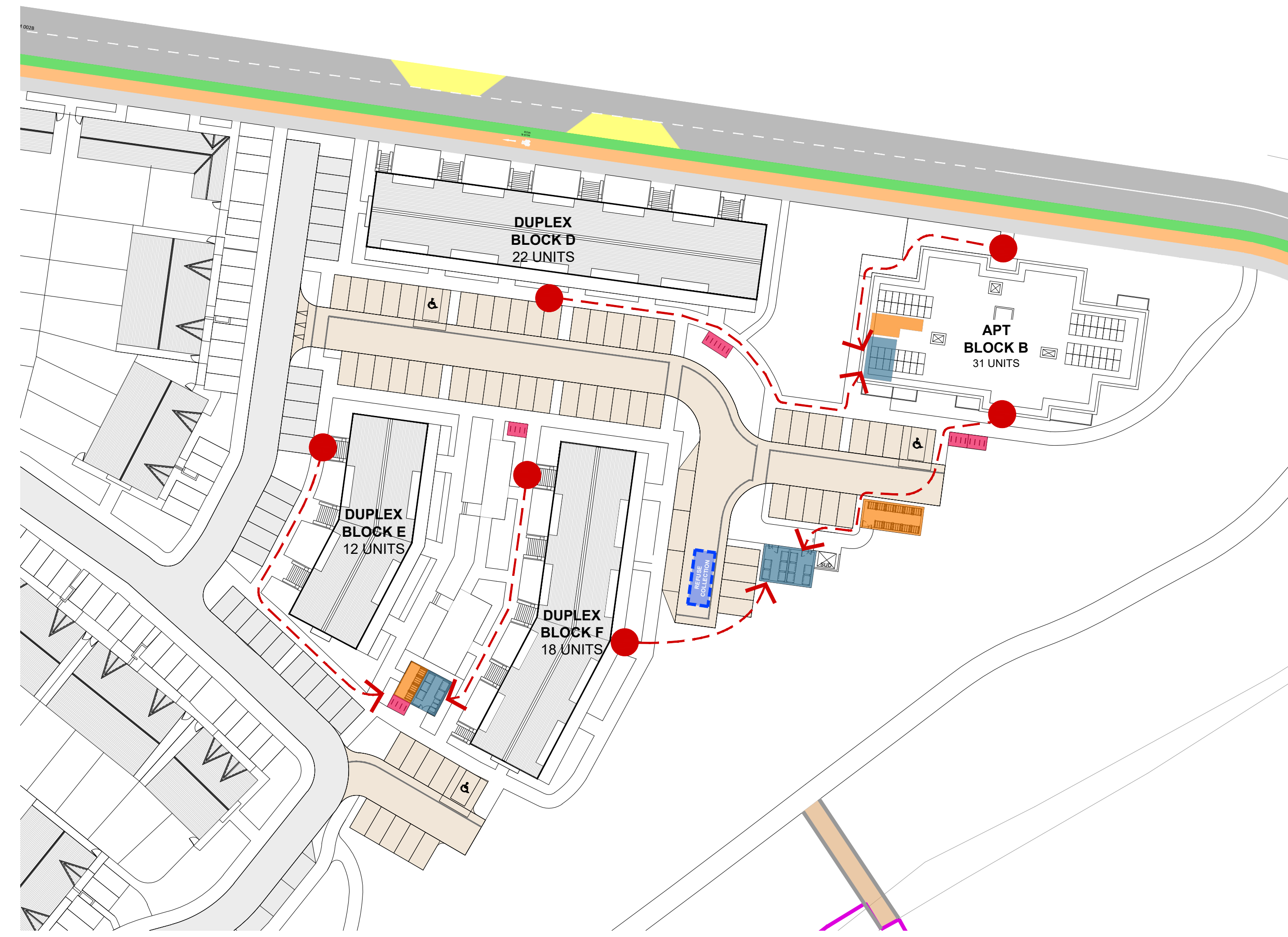
AREA B SITE LAYOUT