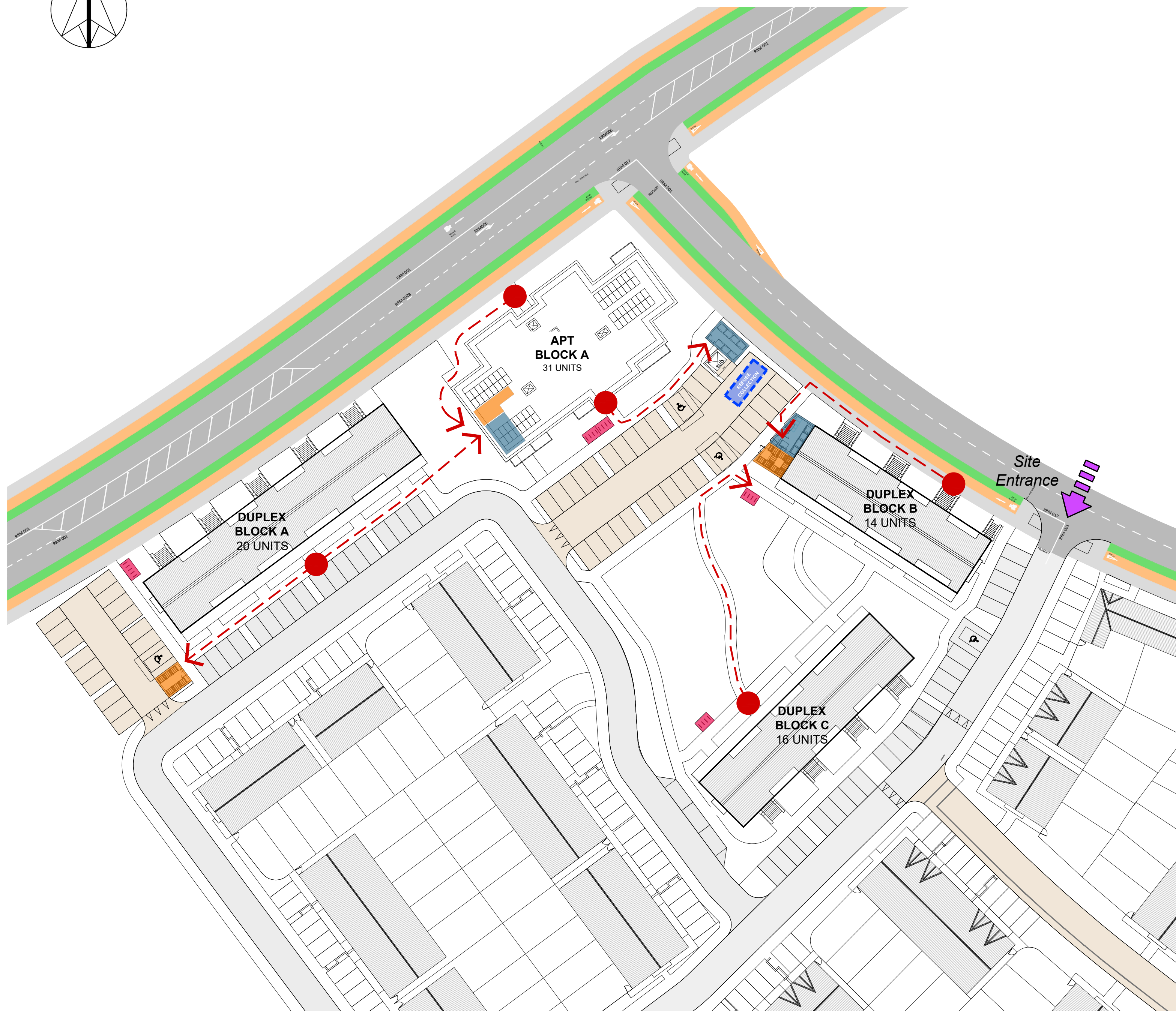
AREA A SITE LAYOUT