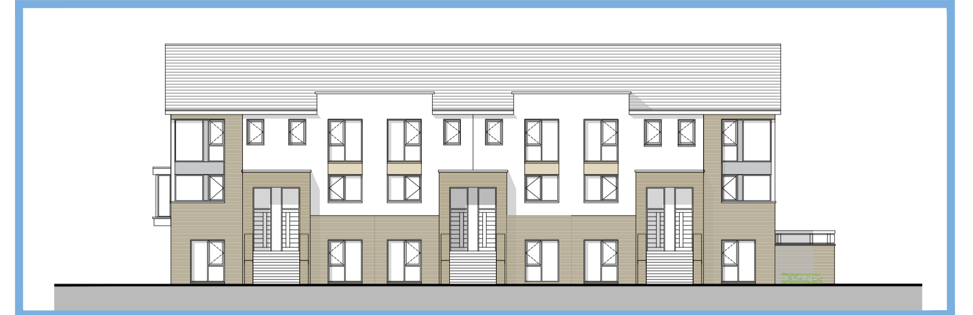
CHARACTER AREA 2 FRONT ELEVATION TERRACED HOUSE TYPE C