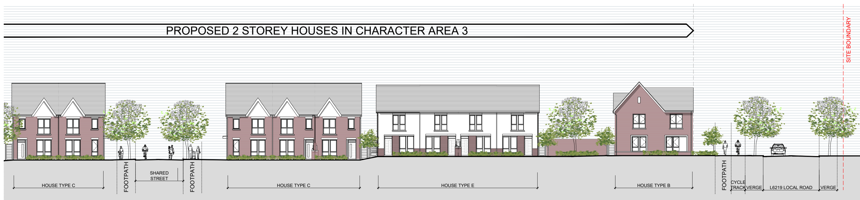
Site Section DD Continued