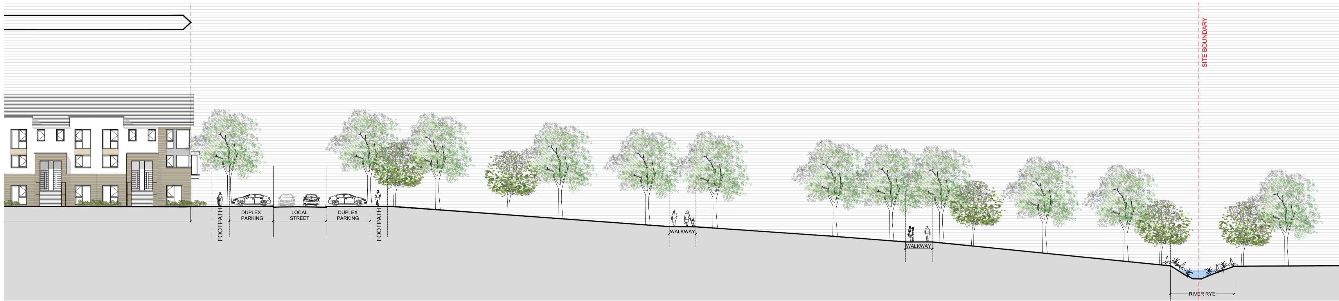
Site Section CC Continued