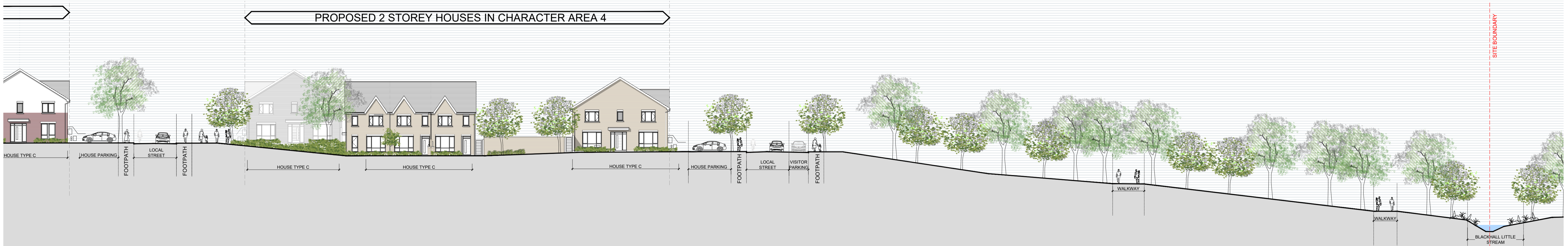
Site Section EE Continued