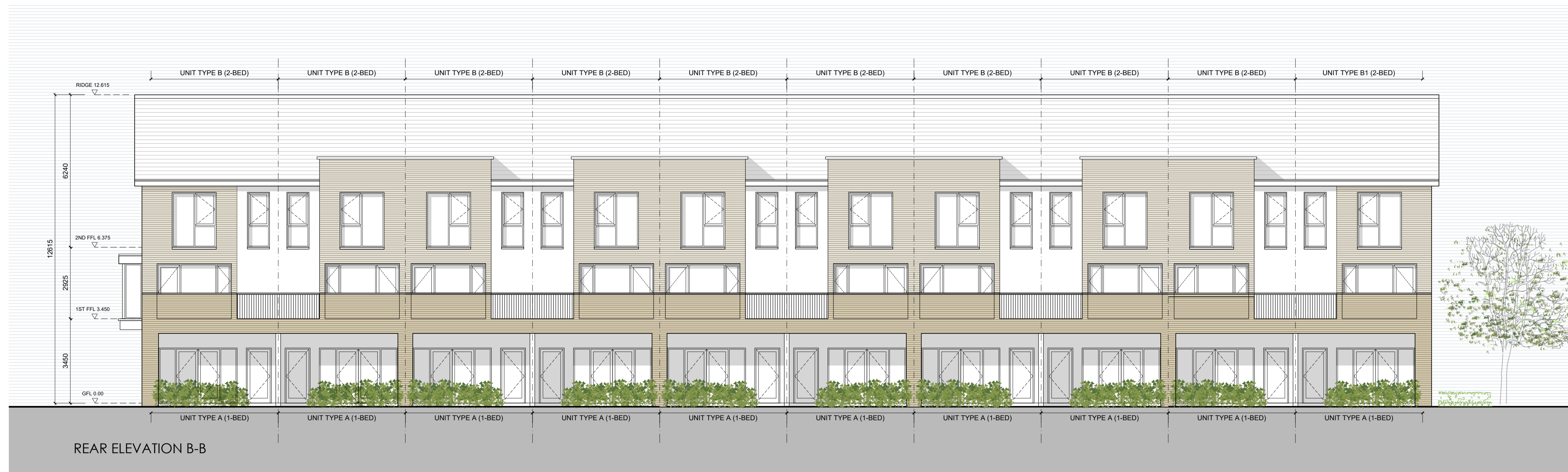
REAR ELEVATION B-B