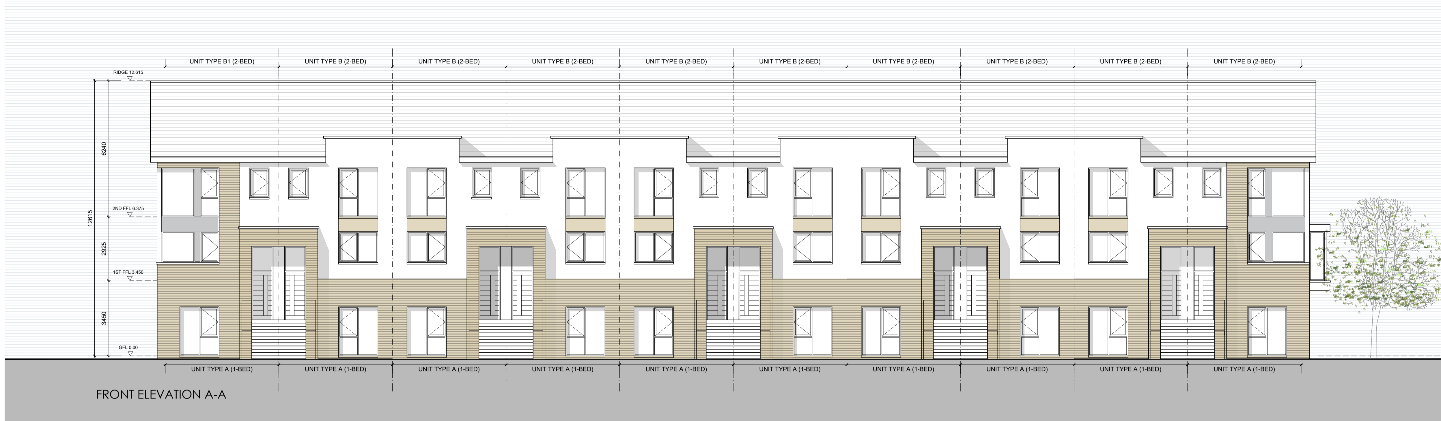
FRONT ELEVATION A-A