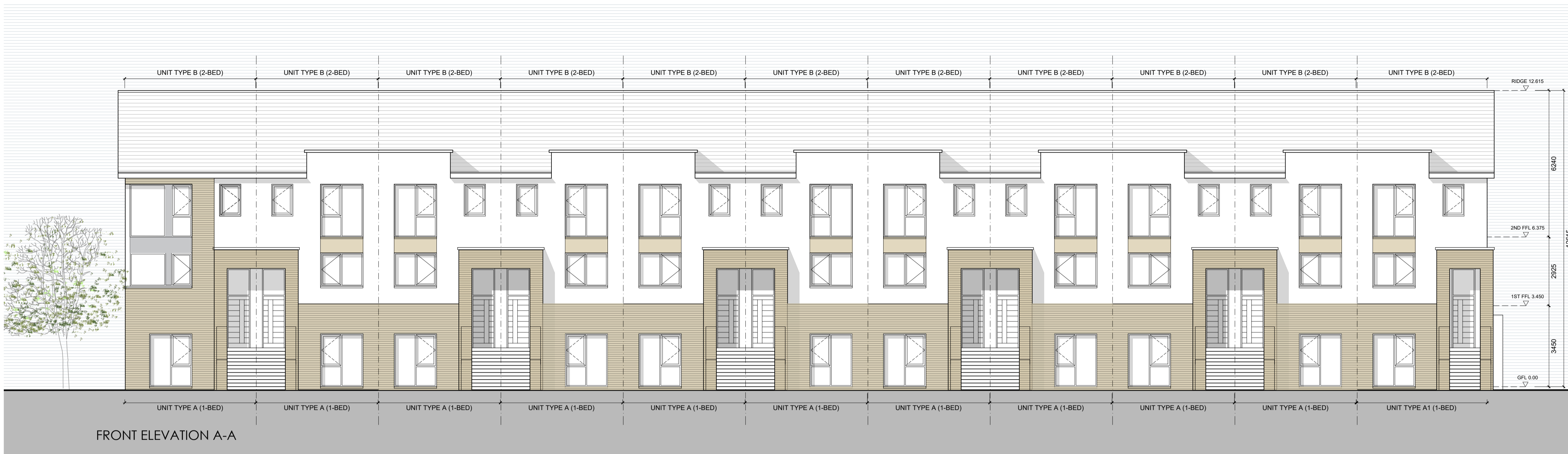
FRONT ELEVATION A-A