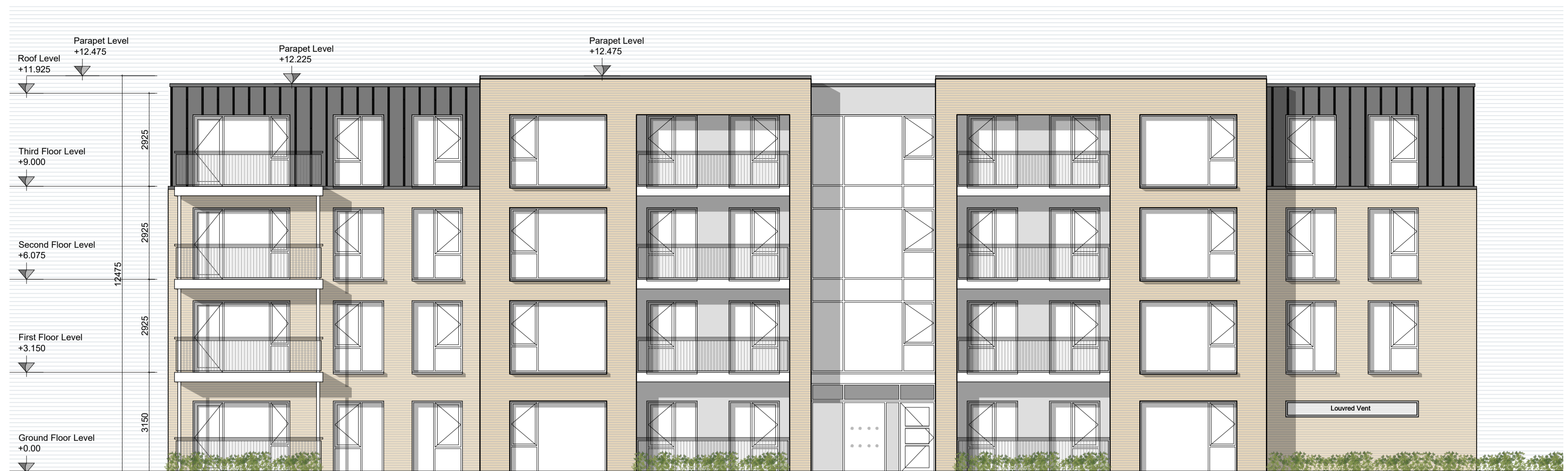
FRONT ELEVATION A-A 1:100