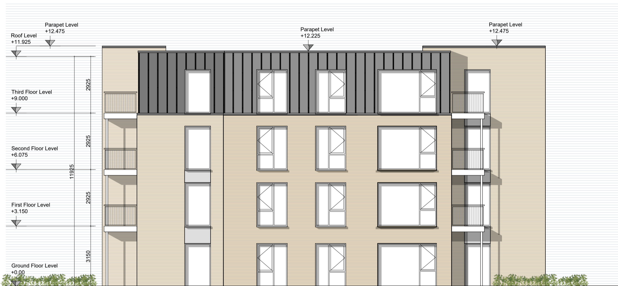
SIDE ELEVATION B-B 1:100