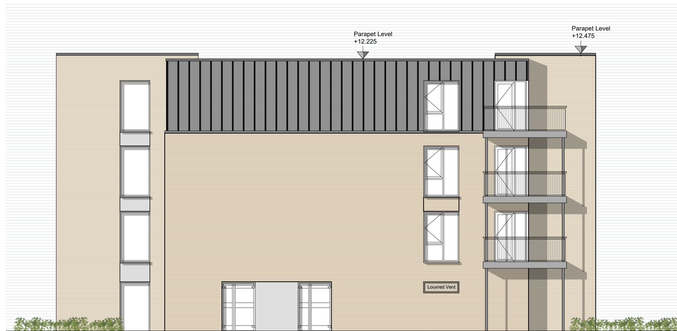
SIDE ELEVATION D-D 1:100