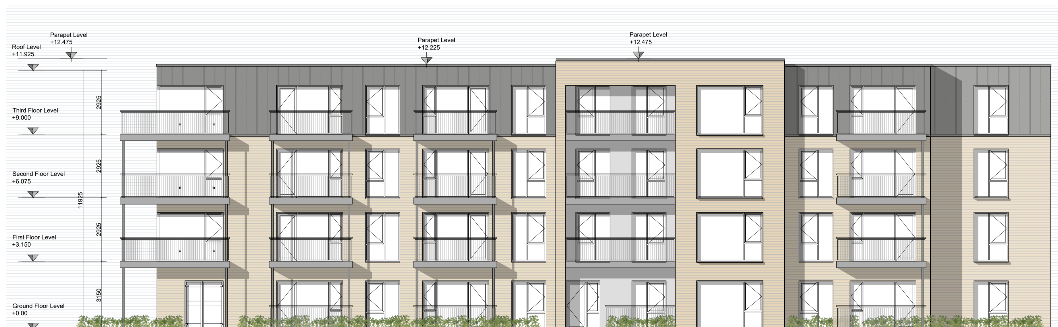
REAR ELEVATION C-C 1:100