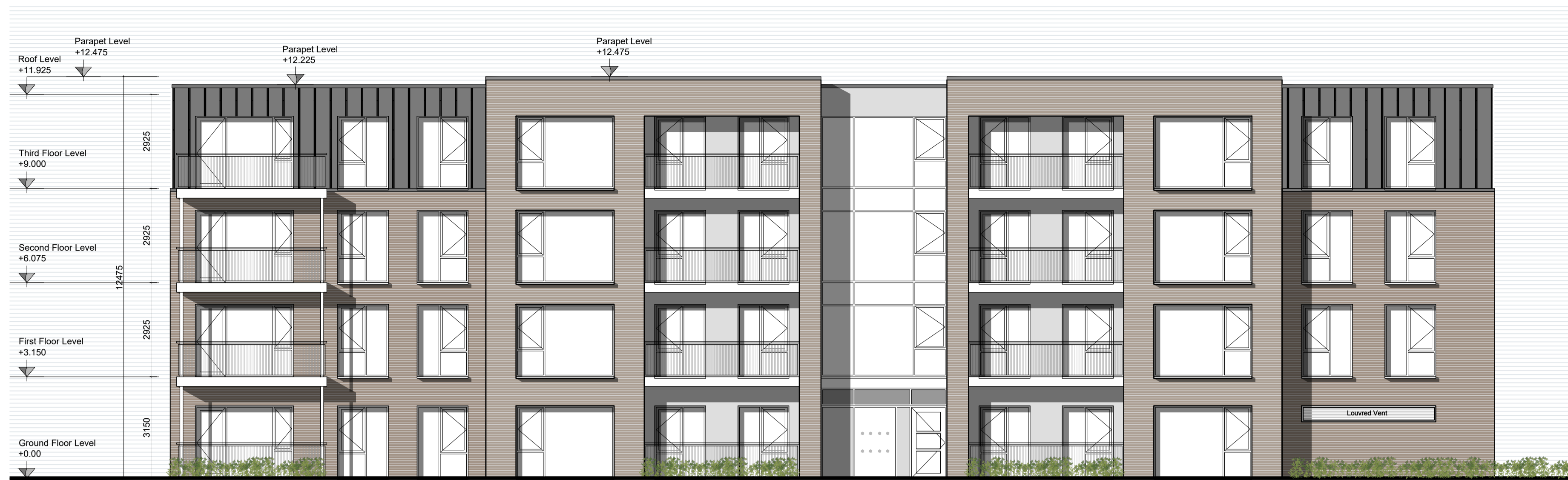
FRONT ELEVATION A-A 1:100