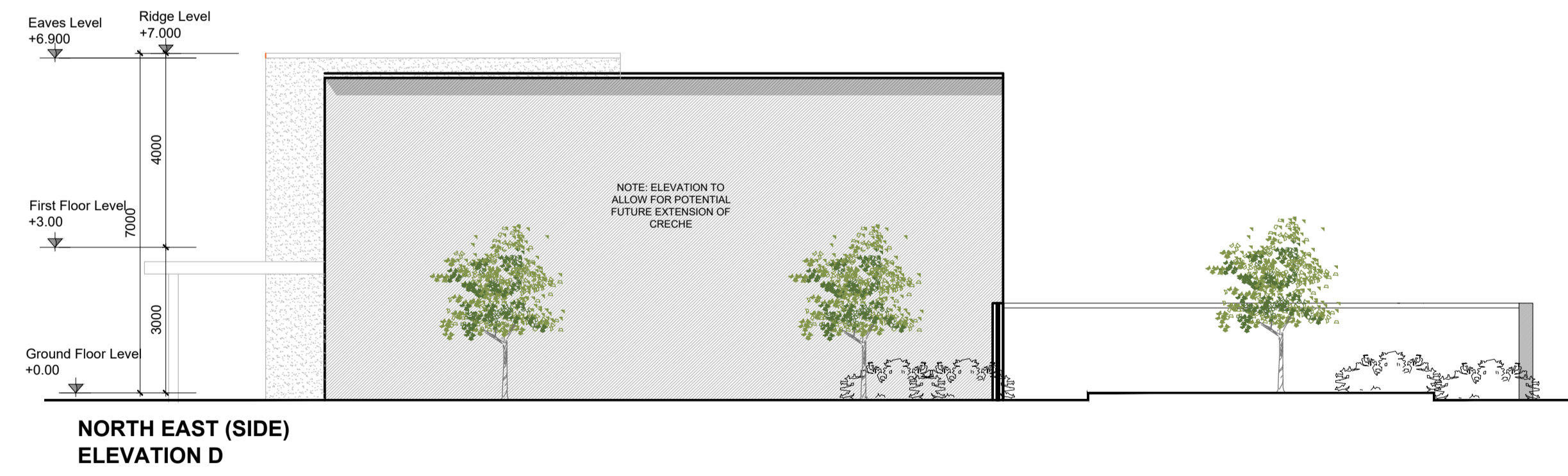
NORTH EAST (SIDE) ELEVATION D