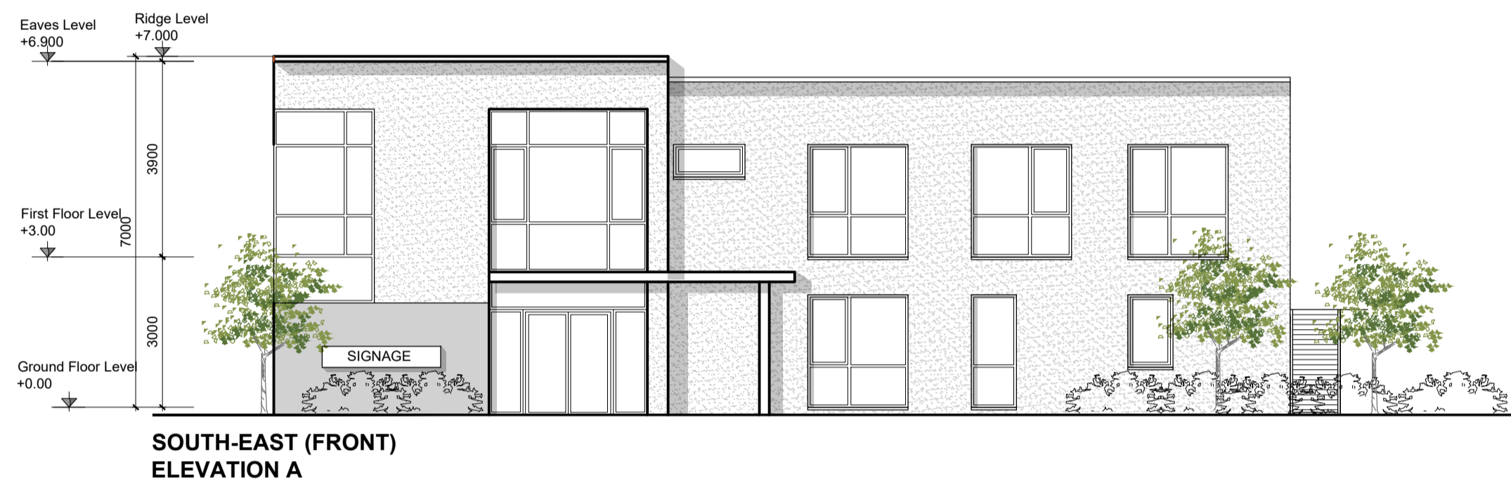
SOUTH-EAST (FRONT) ELEVATION A

GENERAL NOTES THIS DRAWING IS TO BE READ IN CONJUNCTION WITH ARCHITECTS, ENGINEERS AND LANDSCAPE ARCHITECTS DOCUMENTS. NOTES ON FINISHES ROOF: TO BE FINISHED WITH FIBRE CEMENT TILE WALLS: TO BE FINISHED IN A COMBINATION OF TROWEL FINISHED SAND / CEMENT RENDER JOINERY: ALL WINDOWS, DOORS, FASCIA / SOFFIT LININGS TO BE UPVC, ALUMINIUM OR TIMBER FOR PAINTING / STAINING. RAINWATER GOODS: TO BE UPVC OR ALUMINIUM.