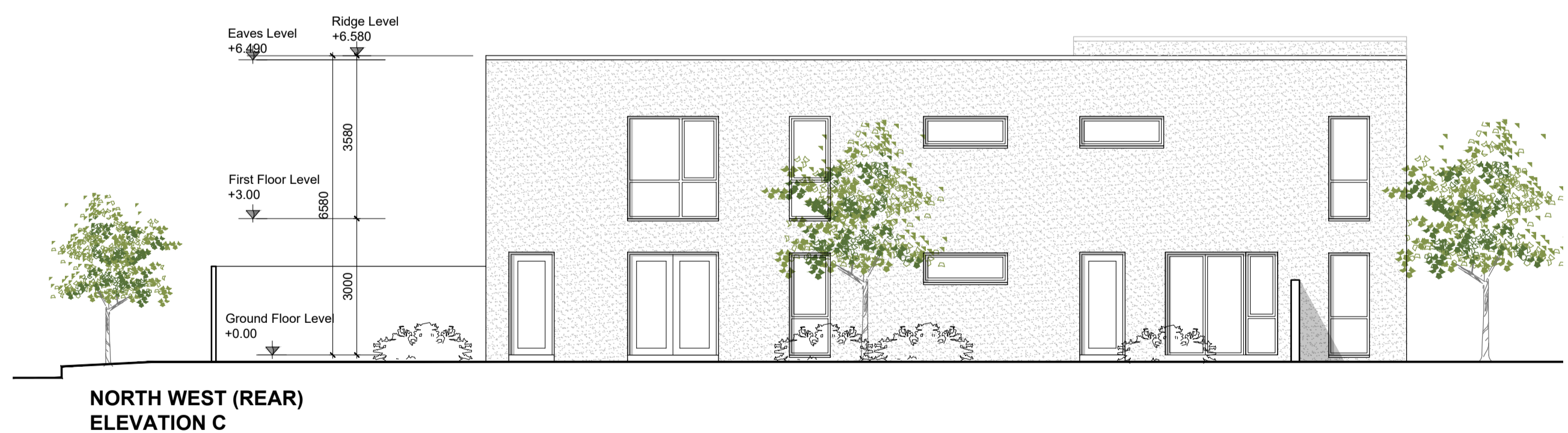
NORTH WEST (REAR) ELEVATION C