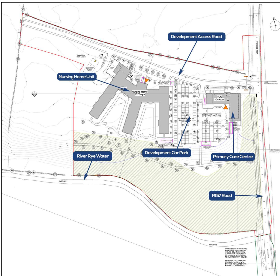
Figure 1: Site Layout

Pedestrian and cyclist infrastructure will also be provided along the R157 linking the primary care centre & nursing home development to the rest of the developments on the Moygaddy lands, as well as the greater Maynooth Environs.