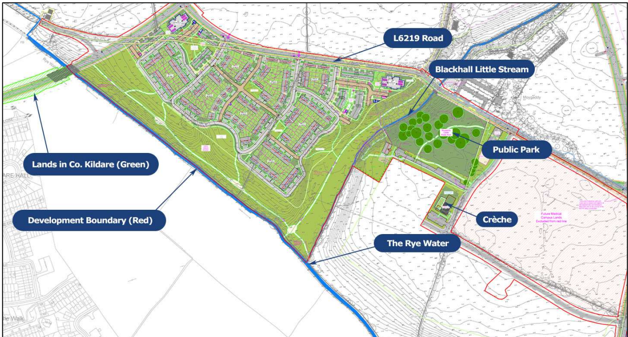
Figure 1: Site Layout

Pedestrian and cyclist infrastructure will also be provided along the L6219 and L22143 linking the residential lands to the creche and public parklands to the east.